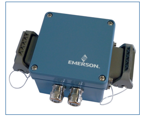
Shown here is one product option. Other options have slightly different sockets and wiring.